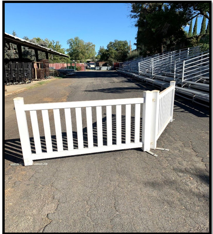
White Vinyl Portable Fencing 6' x 3.5' Sections 40 Sections Available