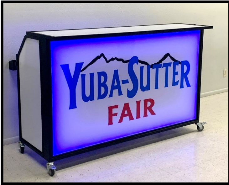
Professional Portable Bar – Blue Tint LED Lighting – YSF Logo