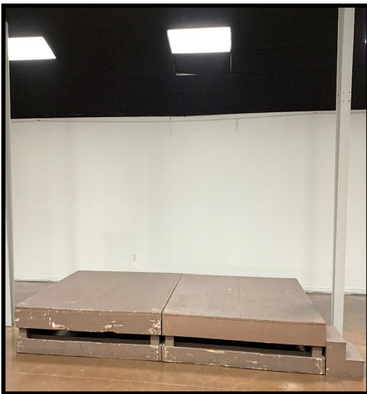
Wood Stage Platforms 8' x 8' x 18" Sections 15 Sections Available