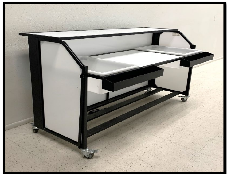
Professional Portable Bar – Backside of Bar