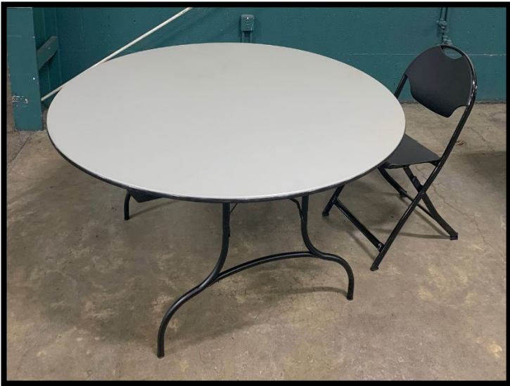
Gray Top w/ Black Trim Round Table w/ Black Chairs 60"CT x 29" Tall