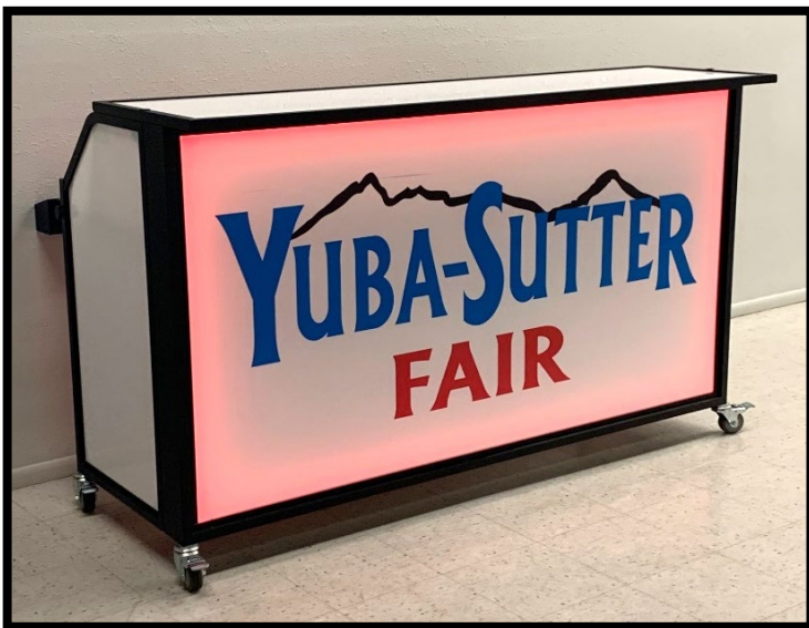
Professional Portable Bar – Red Tint LED Lighting – YSF Logo