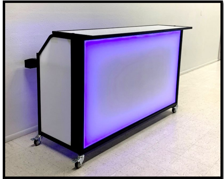
Professional Portable Bars – Blue Tint LED Lighting – No Logo