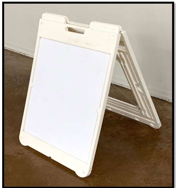
Double Sided Sign Holder "A" Frame Fits 28" Tall x 22" Wide Coroplast Sign 12 Available