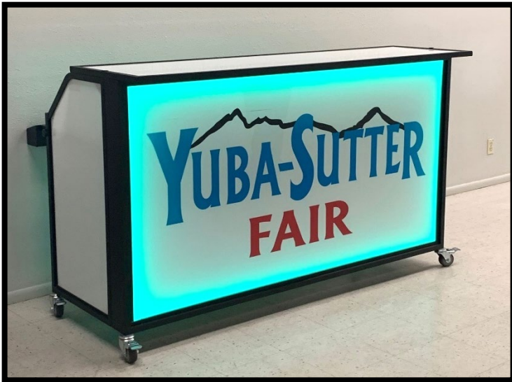
Professional Portable Bar – Green Tint LED Lighting – YSF Logo