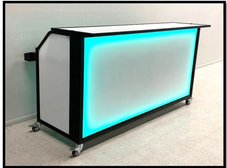
Professional Portable Bar – Green Tint LED Lighting – No Logo