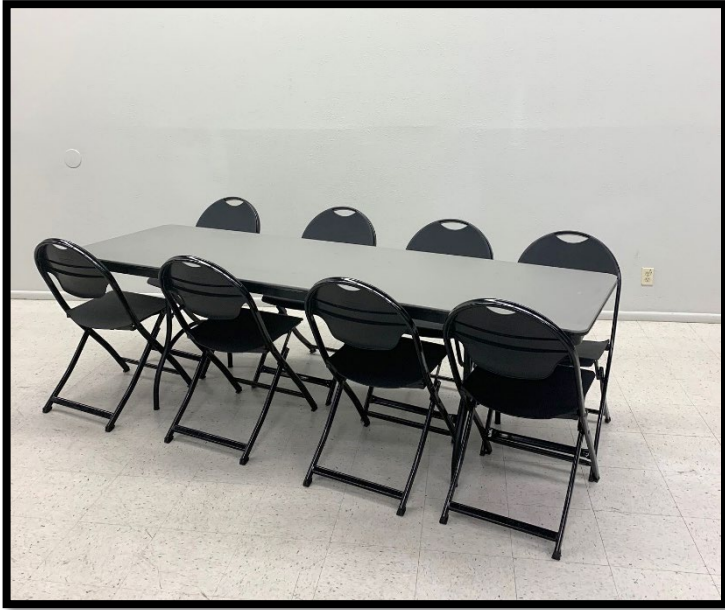
Gray Top w/ Black Trim Rectangular Table w/ Black Chairs 30"W x 8'L x 29"T